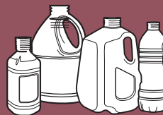
Plastic bottles and Containers #1-7