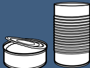
Tin or Steel Cans

Do not include food waste, films, plastic bags, plastic wrap or foam cups and containers.