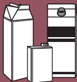
Paper Cardboard, Dairy and Juice Containers