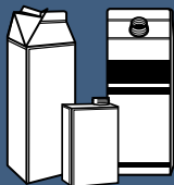
Paper Cardboard, Dairy and Juice Containers