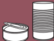
Tin or Steel Cans

Do not include food waste, films, plastic bags, plastic wrap or foam cups and containers.