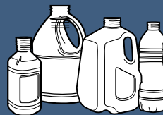
Plastic bottles and Containers #1-7