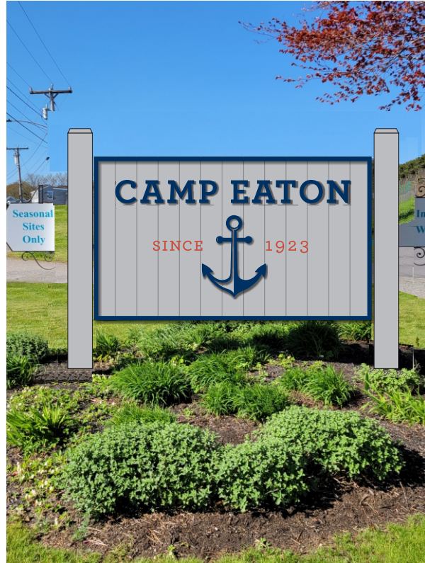
new 9" wide posts